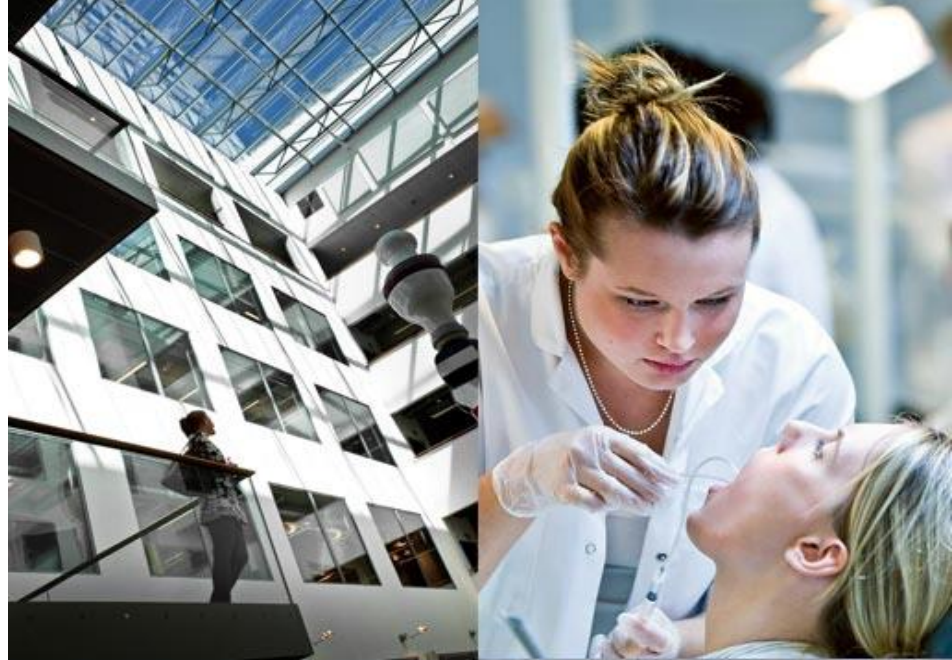
skärpning man det e dags för dig att ta ditt ansvar plocka upp telefonen ring ett fredssamtal

Widening participation is a strategy for quality at our institution and we recruit broad as well as do active work in validation of degrees