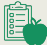
Nutrition & Health