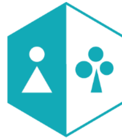
Society and innovation