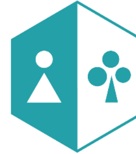
Natural and social sciences